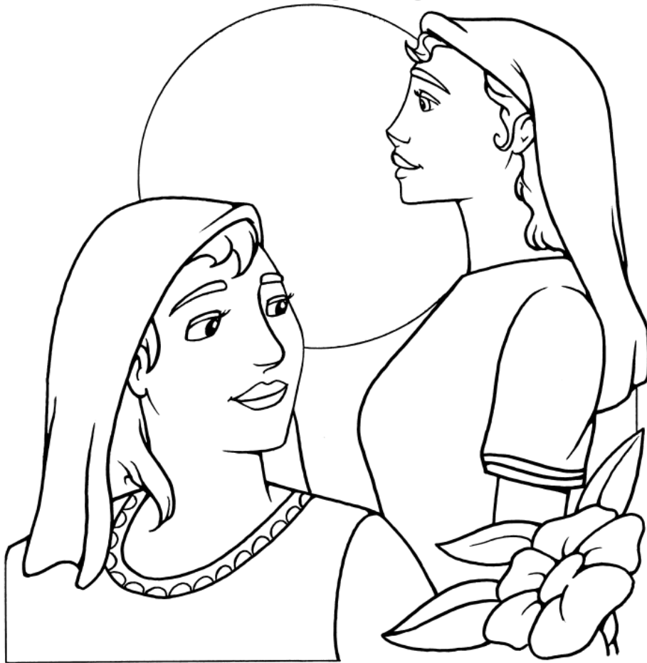
Leah and Rachel

Now Laban had two daughters; the name of the older was Leah, and the name of the younger was Rachel.